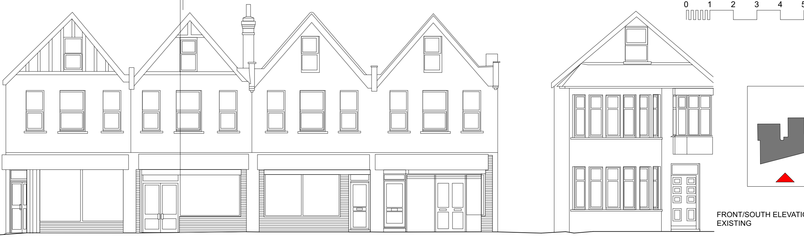
FRONT/SOUTH ELEVATION EXISTING