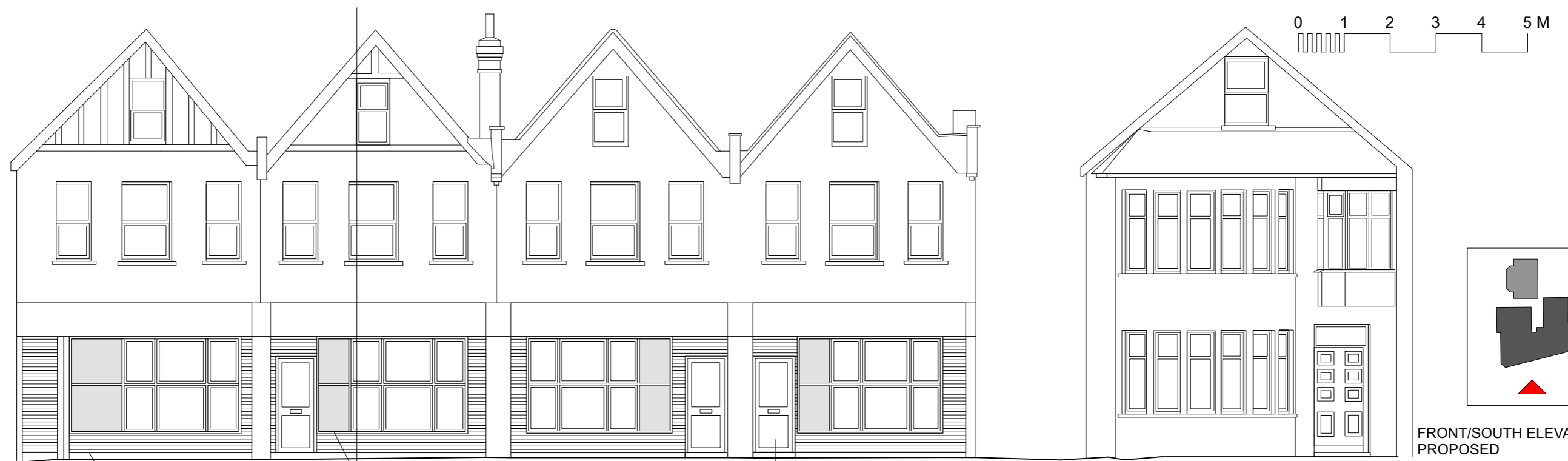
FRONT/SOUTH ELEVATION PROPOSED